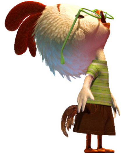
The sky is falling!